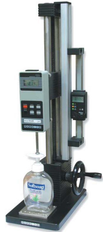
The ES30 is shown in a typical compression testing application, with Series EG digital force gauge, digital travel display, and attachments