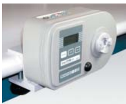
Optional bench mounting bracket

Simply place the torque tool into the universal receptacle and twist. The readout will show the torque value in the clockwise or counterclockwise direction.