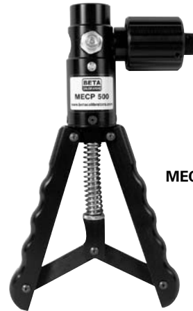
MECP-500 Hand Pump