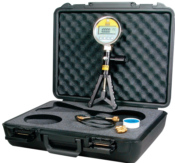
BetaGauge P. I. Kit

Please obtain seal worksheet/ordering information by calling the factory, or visit http://www.betalibrators.com , to download the Sanitary Seal Order Form from the Pressure Products, BetaGauge P. I. section.