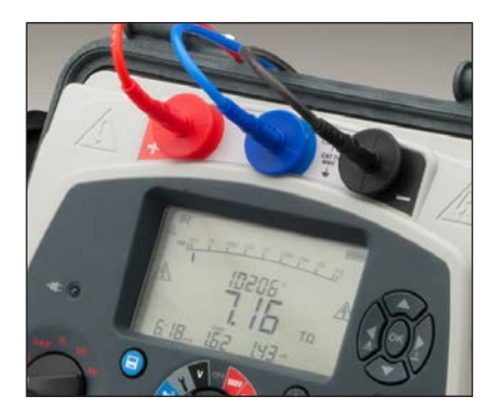
Large backlit LCD shows multiple parameters simultaneously.