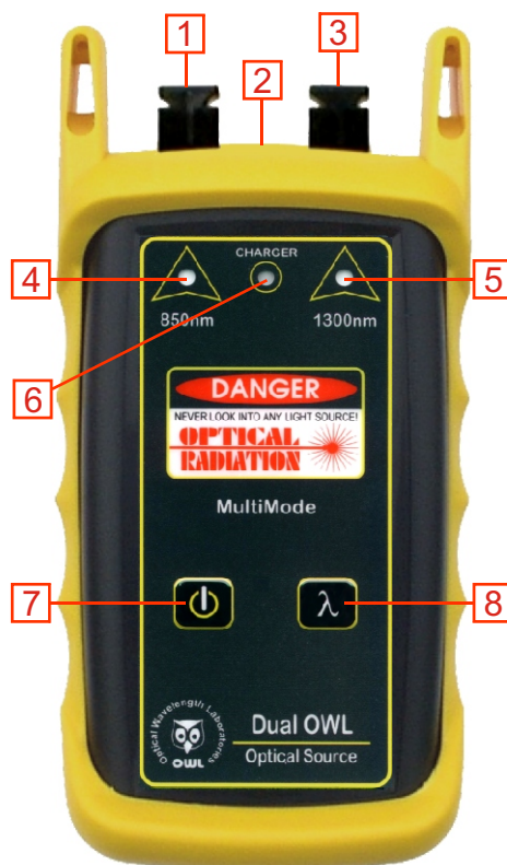
Figure 1 - Dual OWL Multimode Light Source