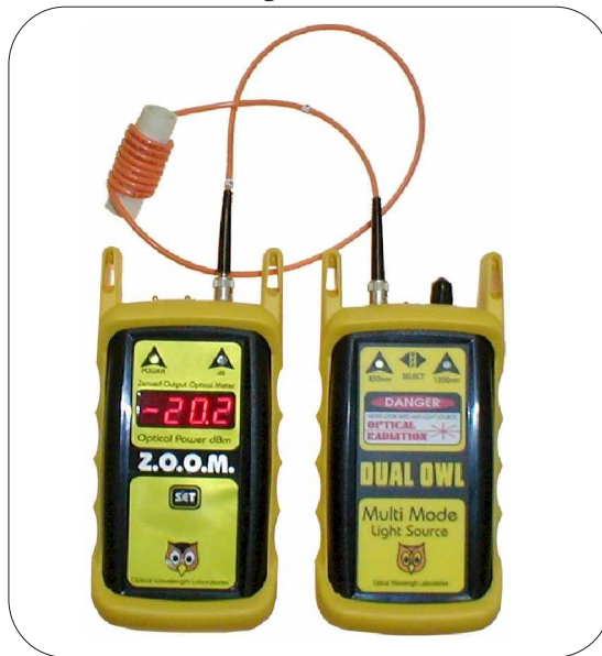
Figure 2 - Setting an Optical Reference

Step 1 - Connect the Silicon ZOOM to a light source via a patch cord as shown in Figure 2. Notice the patch cord wrapped around a mandrel. This is required by popular testing standards on multi-mode patch cords to achieve Equilibrium Mode Distribution (EMD). The purpose of a mandrel is to remove “high-order” modes of light, or light that would not ordinarily travel the full length of a fiber link. If this excess optical energy is not removed, it will cause the power meter to set an incorrect reference and will throw off the final loss readings.