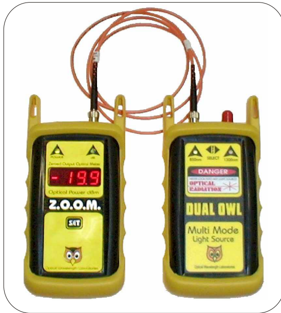
Figure 1 - Optical Power Measurement

Optical Power Measurement Instructions - The Silicon ZOOM can be used to measure the actual amount of power being received by the detector. This is useful for checking the power level of a light source or the total power being transmitted through a fiber link.