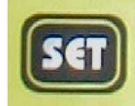
Figure 3 - SET Button

Press and hold for 2 seconds to set reference.