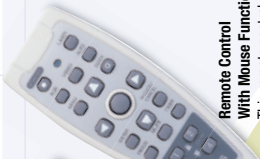
Remote Control With Mouse Function This remote control can be used to operate a personal computer mouse. It is also equipped with a laser pointer function.