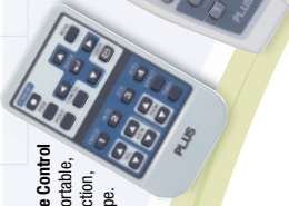
Remote Control Ultra-Portable, full function, card type.

Keep an extra on hand, just in case the unexpected happens.