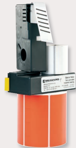
Printer Labels and Cartridges Professional test labels.

Universities, Colleges, Electrical Contractors, Facility Management