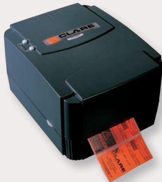
Desk Test n Tag Printer (312A912)

Prints professional tags that won't tear, fade and are tamperproof. Comes with a roll of tags, printer ribbon and PC software disc. Compatible with Supernova Elite and Europa Plus.