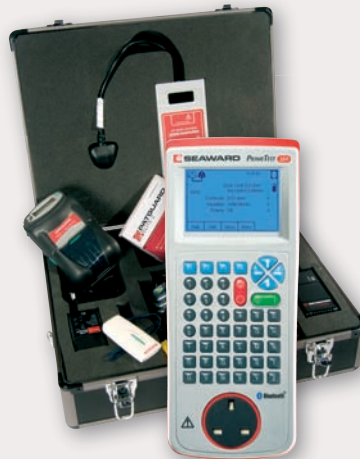
PrimeTest 350 Advanced PAT Solutions Package The must-have tester for PAT professionals.

Universities, Colleges, Electrical Contractors, Facility Management