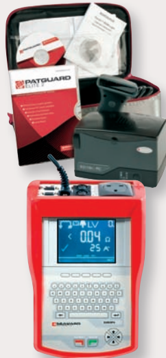
Europa Plus Advanced PAT Solutions Package The portable PAT tester with a big memory.

Construction industry, Manufacturers, Hire companies, Universities, Colleges