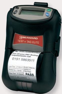
Test n Tag Elite (339A970)

Handy and hard wearing. This ultra-portable printer is made from impact-modified polycarbonate and fused oil, and has an abrasion resistant rubber overmould (six foot drop protection). Featuring smart battery management to monitor battery for longer life and performance. Labels are tamperproof, waterproof and professionally printed with your logo and barcode. Compatible with PrimeTest 350 PAT tester.