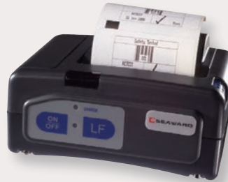
Bluetooth Thermal Results Printer (339A930)

Suitable for use with the PrimeTest 350. With Bluetooth technology, it transfers test results directly from tester to printer, allowing a test result record to be printed immediately, either to leave with your client or for your own reference records. Can also print results labels.