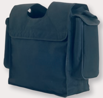
On the move

We are always looking for ways to simplify the process while you're on the move and our handy accessories below can help.