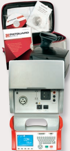
Supernova Elite Advanced PAT Solutions Package Carry out any test with this dual voltage PAT with flash test and memory for results storage.

The rugged Supernova Elite is a comprehensive tester. It does anything you need, including flash tests, RCD trip time testing and it has dual voltage capability.