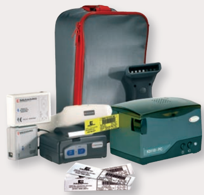
Test n Tag Kit (308A915)

Seaward supply some of the most technologically advanced label printers in the world. They're tough, portable and a joy to use. And they all download test results directly from the tester, allowing results to be transferred from the tester to label in a matter of seconds. We also supply a range of tough, versatile labels that are compatible with every one of our printers.