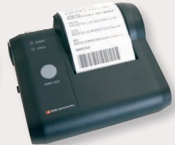
Supernova/Europa Thermal Results Printer (283A954)

Ideal for use with the Supernova Elite and Europa Plus printers, this battery-operated and lightweight thermal printer is perfect for printing test results either to leave with your client or for your own reference and records.