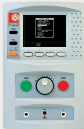
Clare HAL 101 AC/DC Hipot and DC Insulation Tester Part No: H101