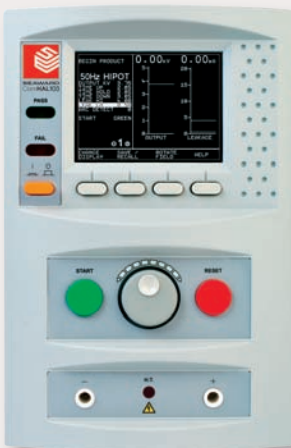
Clare HAL 103 AC/DC Hipot (flash/dielectric strength) and Insulation and Ground/Earth Bond Tester Part No: H103