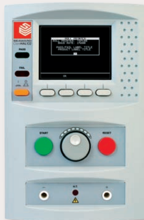
Clare HAL 102 AC/DC Hipot and DC Insulation Tester with built-in scanner switching matrix Part No: H102