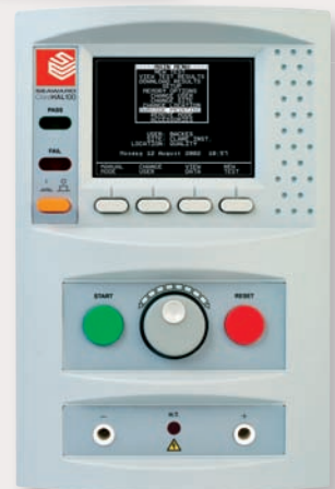
Clare HAL 100 40A Ground/Earth Bond Tester Part No: H100