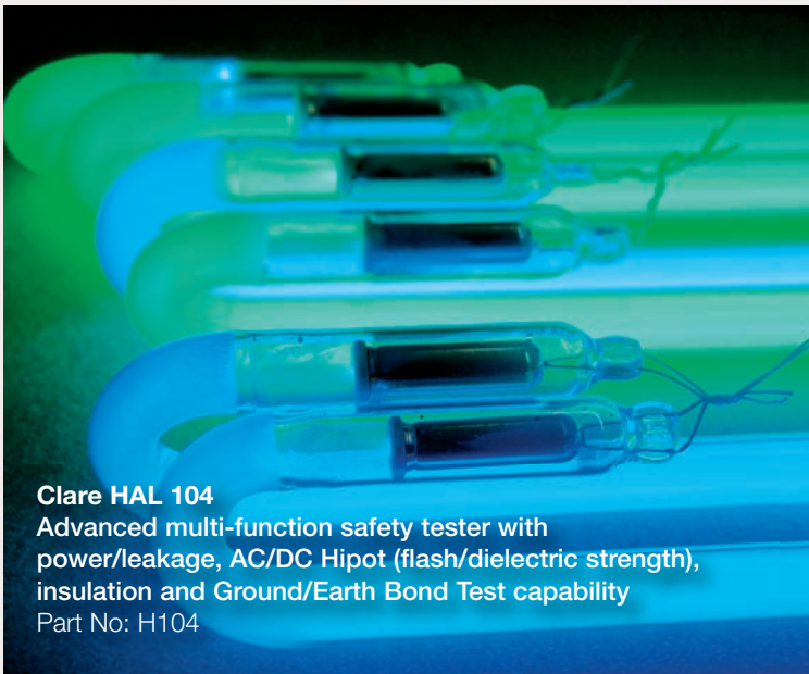
Clare HAL 104 Advanced multi-function safety tester with power/leakage, AC/DC Hipot (flash/dielectric strength), insulation and Ground/Earth Bond Test capability Part No: H104