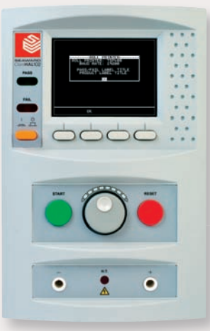
Clare HAL 102 AC/DC Hipot and DC Insulation Tester with built-in scanner switching matrix Part No: H102