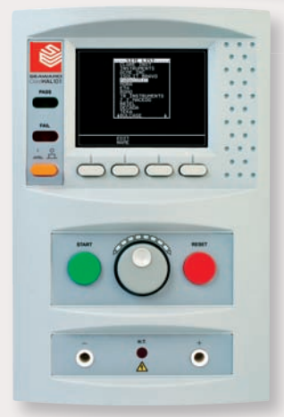
Clare HAL 101 AC/DC Hipot and DC Insulation Tester