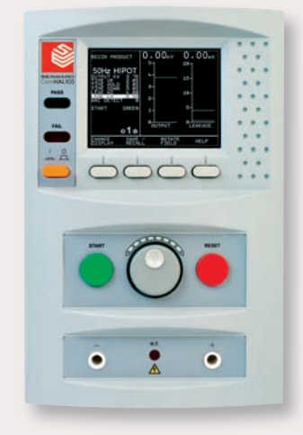
Clare HAL 103 AC/DC Hipot (flash/dielectric strength) and Insulation and Ground/Earth Bond Tester Part No: H103