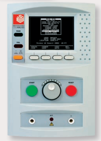
Clare HAL 100 40A Ground/Earth Bond Tester