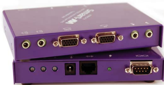
XTPRO Transmitter and Receiver