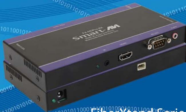
FiberXtend Series From SmartAVI, Inc.