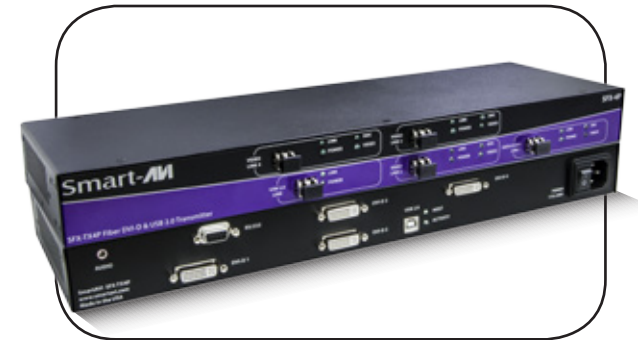
4-Port DVI-D, USB 2.0, Audio and RS232 Fiber Extender