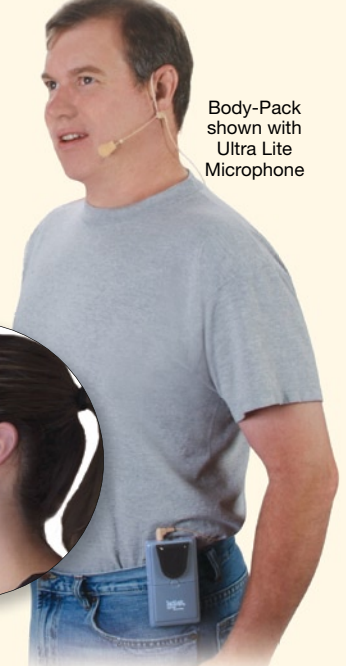
Body-Pack shown with Ultra Lite Microphone

A miniature element on a very small boom gives this microphone several virtues – lightweight, high performance, comfort, and low visibility. Available in Tan or Black.