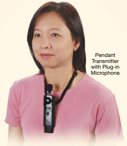
Pendant Transmitter with Plug-in Microphone