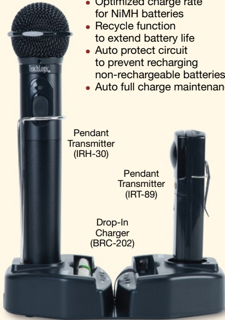
Pendant Transmitter (IRH-30)