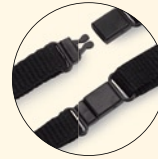
Safety Clasp Easy to engage – pull to break away