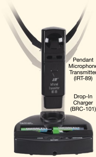
Pendant Microphone Transmitter (IRT-89)