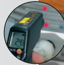
830-T2, 2 point laser sighting (real measurement point)