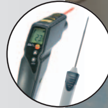
830-T2/-T3, possibility of connecting an external probe

For fast measurement of surface temperatures