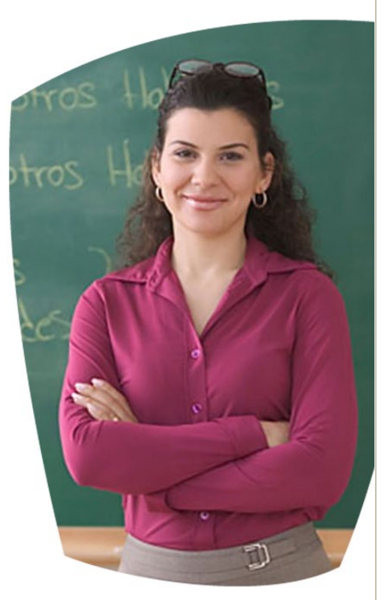
Celebrating 26 Years Working with Education

Track Technology Systems, Inc. accepts school purchase orders via fax or email. If you are first in need of a quote, please use the contact form to relay your desired quantity, the make, and model of interactive whiteboard(s) you have. Track Technology Systems, Inc. is actively seeking dealership opportunities in all states. Please call us to inquire.