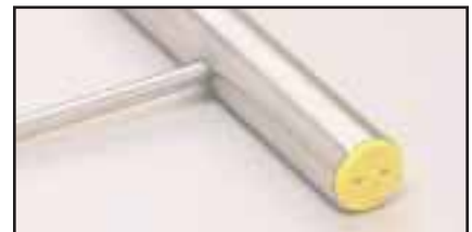
Close up of T-Handle Piercing Probe showing thermocouple connection on side of handle.