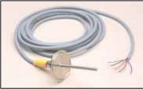
SPD Sanitary Probe Shown with Cable #12071-02