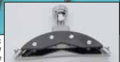
RTC825 Heavy-Duty Curved Surface Band Probe