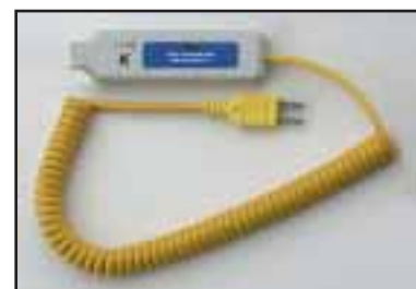
TCL329 Extension Handle