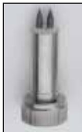
RTC827A Heavy Duty Ingot Probe

Response time legend (to 99% of 212°F): (1) clean hot plate surface (2) immersion in boiling water