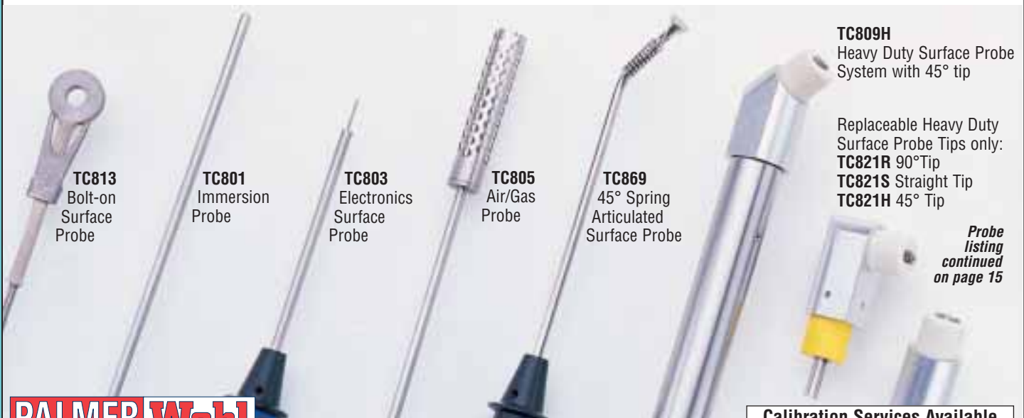
TC813 Bolt-on Surface Probe

Response time legend (to 99% of 212°F): (1) clean hot plate surface, (2) immersion in boiling water (3) immersion in liquid solder bath