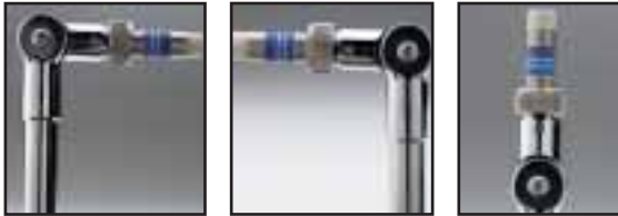
TC829 Systems have a fully articulated head for adjustment to any measurement angle required.

RTC822 Z-Tip Fast Response Surface Probe for molds, platens, dies, bearings, glass or any other clean surface to 1000°F 3 sec. response (1) . 1/2" diameter tip x 1" length.