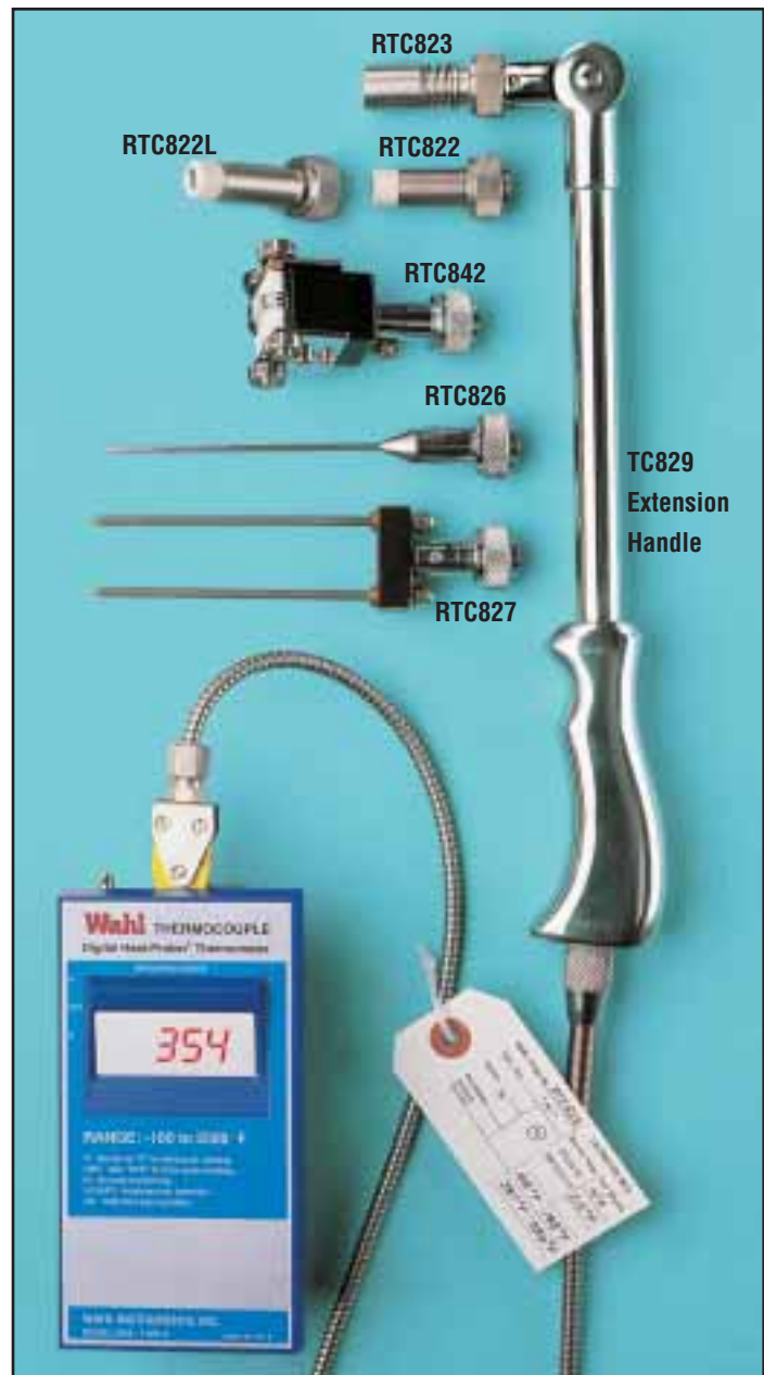
TC829-12 in use with 2500MVX Meter, page 10.