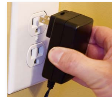
Patented power supply design helps give this iron outstanding performance