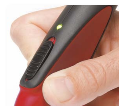
Red power-on LED turns green when iron reaches working temperature