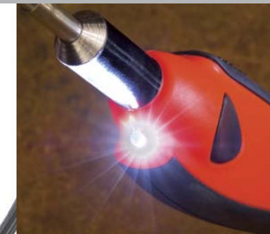
Bright LED illuminates the work, so its easier to make perfect solder joints