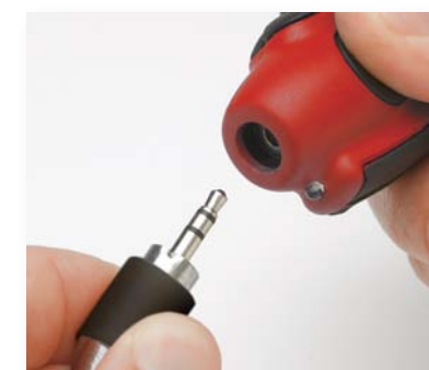
Easy and quick tip change-out with modular plug and rubberized sleeve