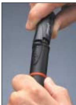
Automatic safety fuel cut-off when cap is replaced.