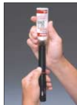
Refuels in just 20 seconds with standard butane lighter fuel.