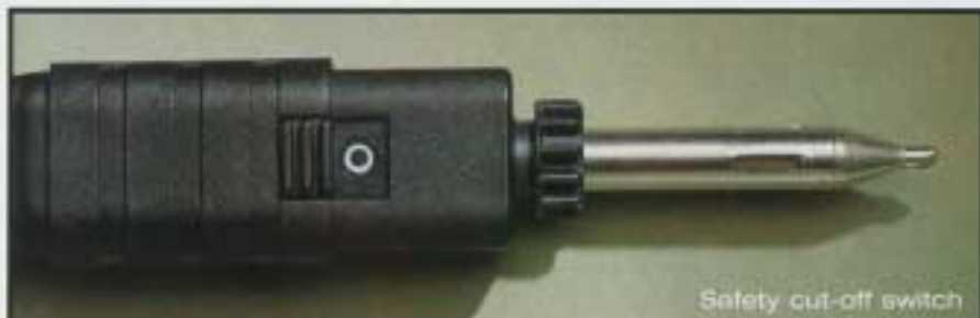
Safety cut-off switch

There are no cords, batteries, or cartridges, so the Portasol C1C goes anywhere. Accessories include 1/8" chisel tip and 1/8" needle soldering tips, as well as a hot knife tip.