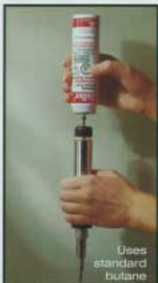
Uses standard butane