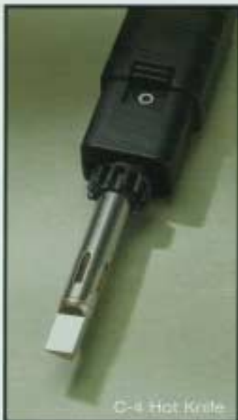
C-4 Hot Knife