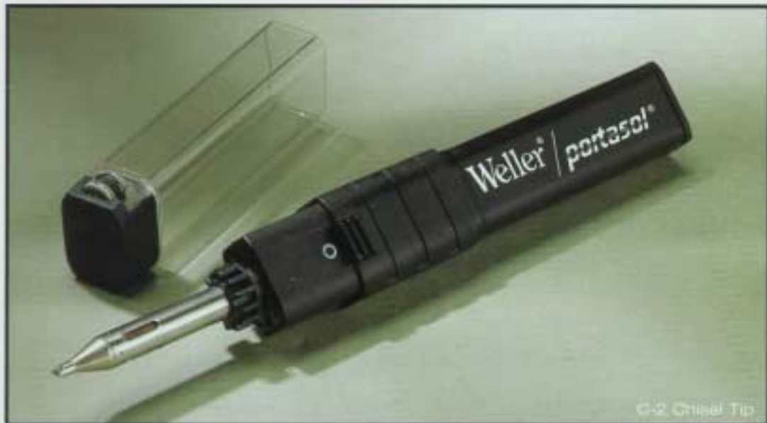
C-2 Chisel Tip