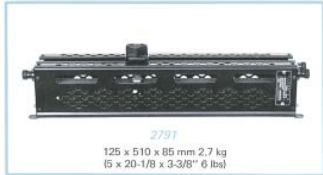
2791 125 x 510 x 85 mm 2.7 kg (5 x 20-1/8 x 3-3/8" 6 lbs)

Model 2791 is composed of resistance wire with an insulating coating wound on a frame of special ceramic and a sliding brush that maintains contact with the wire. Resistance is continuously variable and can be increased or decreased as desired.