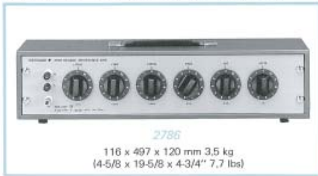
2786 116 x 497 x 120 mm 3.5 kg (4-5/8 x 19-5/8 x 4-3/4" 7.7 lbs)

Models 278610 and 278620 six-dial decade resistance boxes allow quick and easy setting of a wide range of resistance. These resistance boxes are used in combination with voltage or current standards to adjust voltage or current, as dummy load resistances or as an arm of AC bridges.