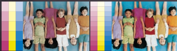
Conventional 8-bit processing BenQ 10-bit processing

Driven by HQV Technology, standard definition video is transformed! Content is de-interlaced, noise is reduced and images are elevated to HD quality through resizing and scaling up to 6 times. Independent pixel processing, true 10-bit color and independent color management deliver astounding image precision, color and clarity.