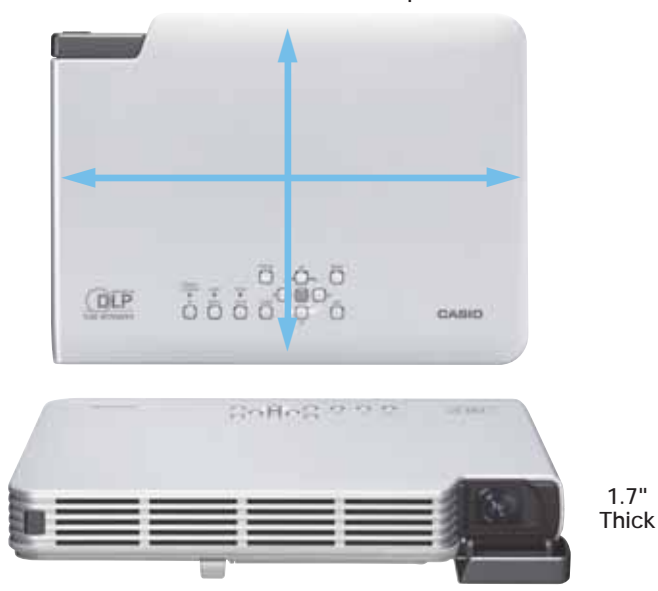
10.63" Wide x 7.83" Deep