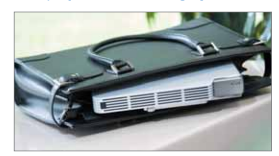
Traveling with the Casio Super Slim couldn't be easier - whether you use your laptop, or the PC free option.

Casio Super Slim projectors take the hassle out of travel so you can be the ultimate road warrior. At just under four pounds, it's lighter than most laptops so it won't weigh you down. And at a mere 1.7" thick its thin profile will make packing for your travels a breeze... forget the extra bags, just stow it away in your briefcase.