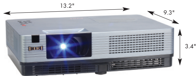
LC-XBL21 - XGA "Brilliant" Series Projector.

EIKI® is a registered trademark of Eiki International, Inc.