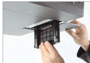
Up to 13,000 hours of use between air filter changes.