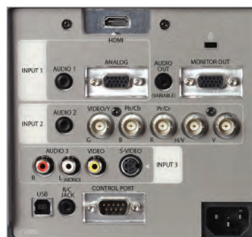
Just connect, and project.