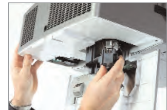
Up to 6,000 hours of use between lamp changes (2).