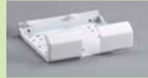
Anti-theft bracket for TT-02RX