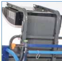
Frame supports Hitachi CP-A52 Ultra-Short Throw