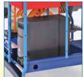
Shelf for CPU