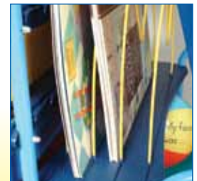
Storage for Big Books