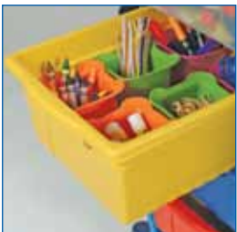
Sliding tubs for quick access to supplies