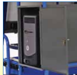
Lock Box for CPU