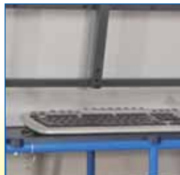
... keyboard or monitor