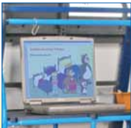
Top shelf for laptop ...