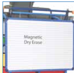
Removable lined magnetic dry erase board (AC455)