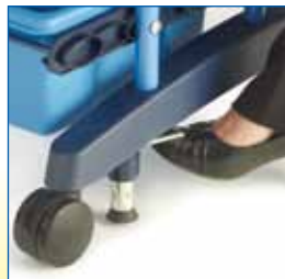
3" (7cm) casters with Foot-Activated Brake