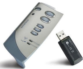
mimio Wireless module and USB receiver