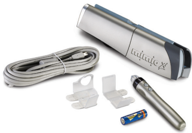
mimio Interactive Xi Bar, mimio Mouse/Stylus, USB cable (16 ft / 5 m), battery for mimio Mouse/Stylus, mounting brackets