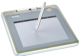
mimio Pad lets you control your system from throughout the room.