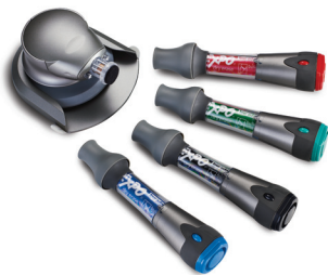
mimio Capture Kit digitally records dry-erase marker.