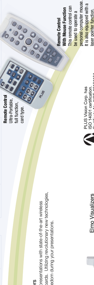
Remote Control Ultra-Portable, full function, card type. Remote Control With Mouse Function This remote control can be used to operate a personal computer mouse. It is also equipped with a laser pointer function.

PLUS Vision Corp. has ISO 14001 certification. Certificate No. NQE-0210118A PLUS Vision Corp. has ISO 9001 certification. Certificate No. 12.100.17396 TMS