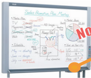
M Series copyboard (The image above is the M-10S.)

No PC necessary. Store information as-is on CF card.