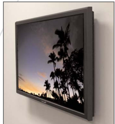
Recess your swingout arm for a finished look

Model: INW-AM325 Suggested List: $299.99 Color: White Fits: 37"-61" Displays Dimensions: 4"x26"x32" Max Load: 160 lbs