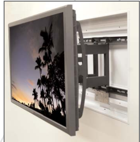
Supports AM250 and AM3 swingout arms. No mount assembly required.