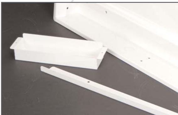
Power box and multiple knockouts are available for running power and cables.