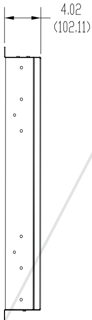
INW-AM325 (side view)