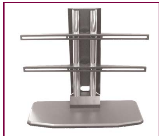
PSD-TTS/B - Black Base