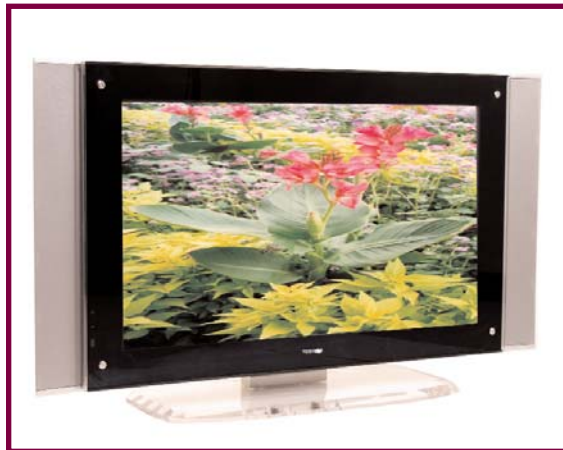
PSD-TTS/C - Clear Acrylic Base

PSD-TTS comes with a silver MDF base (above) or you can order it with a clear acrylic base as model PSD-TTS/C or black base as PSD-TTS/B (below).