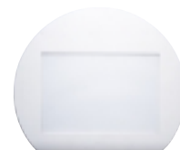
Light Box SLB-80