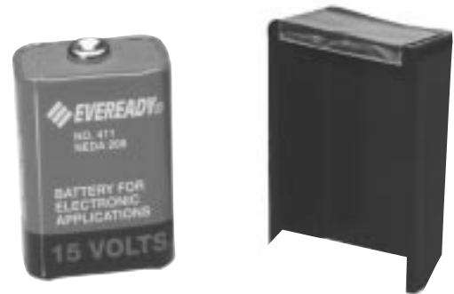
Model No. 45002