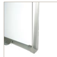
Mistic Premium Whiteboard