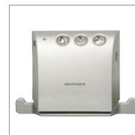
Left Side Bridge for CopyCam Pro