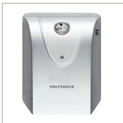
CopyCam E Image Capturing System

Capturing spontaneous ideas is easy with CopyCam E Image Capturing System. CopyCam E offers the same benefits as CopyCam Pro, with a streamlined (one-button) control panel. When ready to save your notes to the archive, just press one button to capture in full color.