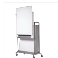
Huddleboards on a Mobile Easel

Lightweight, portable, and versatile – Huddleboard offers a display surface that can be easily moved to a CopyCam for image capture, then moved away for use elsewhere. Huddleboard, when used with CopyCam, provides flexible and multiple solutions for your working or learning environment.