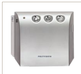
CopyCam Image Capturing System with USB