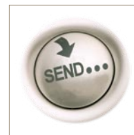
One-Click-Publishing Note Capture