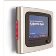
RoomWizard Room Scheduling System

Integrating RoomWizard with CopyCam's note-capturing technology enables you to easily pick up where you left off and move forward in your next meeting.