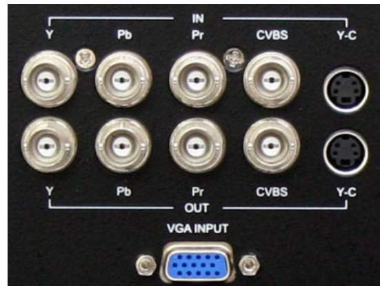
Figure 3: (right) Close up of rear panel inputs showing 8 BNC connectors (in & out) for HD component (Y Pb Pr) and composite video per LCD screen, along with S-Video connectors for Y-C video and a VGA input connector. All loop-thru connectors are active and auto-terminating.