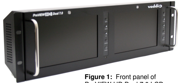
Figure 1: Front panel of PreVIEW HD Dual 7.0 LCD

Vaddio's PreVIEW HD line of monitors are excellent for a variety of applications that require high resolution monitoring of HD cameras, including houses of worship, training rooms and board rooms at corporate facilities, as well as instructional facilities at teaching hospitals.