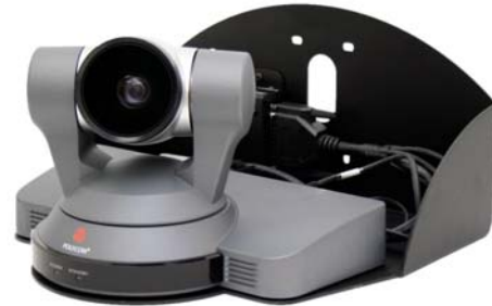
Figure 1: WallVIEW PRO EagleEye 1080 HD System with EagleEye 1080 HD camera (not included), EZIM and Wall Mount

The WallVIEW PRO EagleEye 1080 HD has many new features including a four position distance adjustment for CAT-5 cabling, Y-Gain adjustment for cable length compensation, IR forwarding, 1-RU rack mount QCP interface and the small EZIM, which is intended to be paired with the Polycom EagleEye 1080 HD PTZ camera provided with the Polycom HDX codecs. Like all Vaddio WallVIEW systems, it comes with the Thin Profile Wall Mount and mounting hardware.