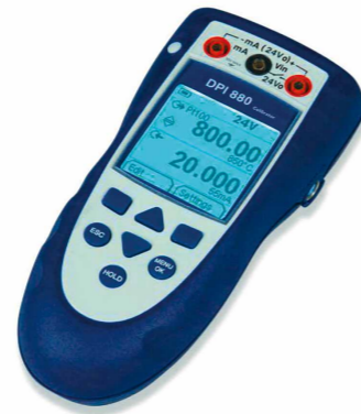
DPI 880 Handheld Multi-function Calibrator

[ Cost-effective, highly accurate and packed with features ]