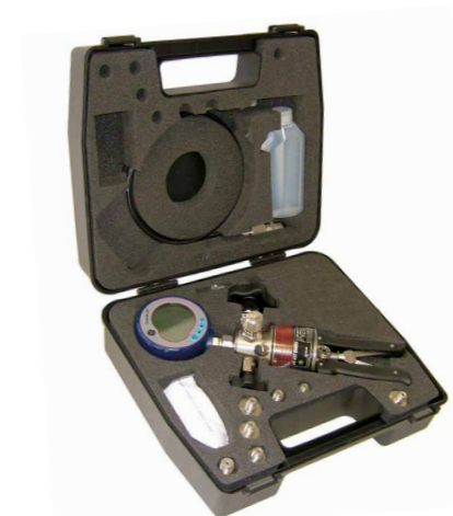
PV Hand Pump & DPI 104 Indicator Packages