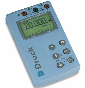
UPS-III Rugged and Extremely Compact Loop Calibrator

⚠ Safe and Hazardous area versions available