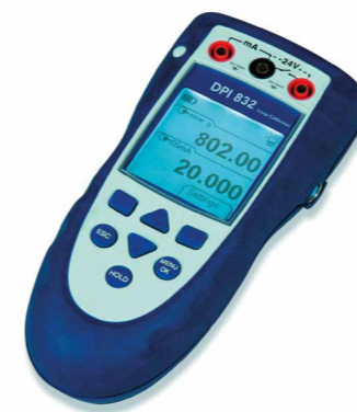
DPI 832 Handheld Electrical Loop Calibrator