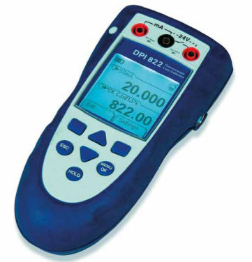
DPI 822 Handheld Thermocouple Calibrator