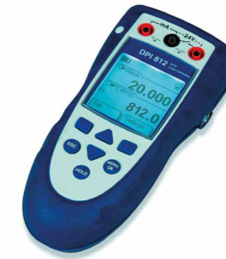
DPI 812 Handheld RTD Loop Calibrator