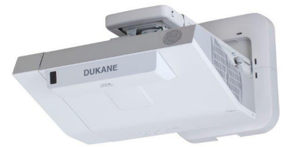
Wall Mounted (with cable cover)