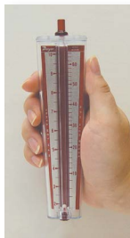
Hold this way for low scale reading