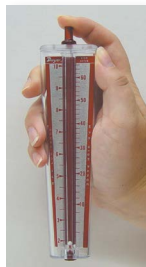
For high scale reading, finger covers hole