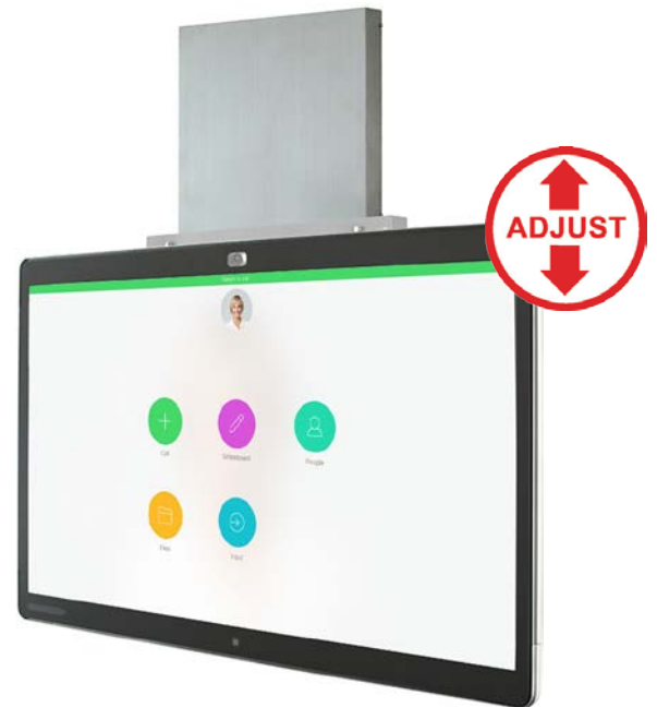
Shown the 55" Cisco Spark Board