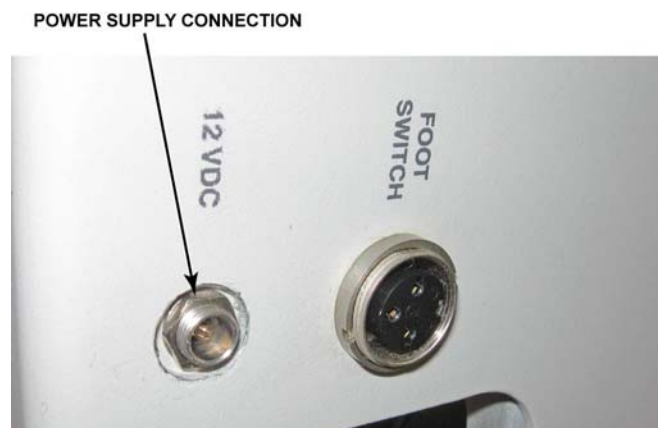
Figure 3: E-DWT rear view detail: power supply connection