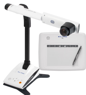
LX-1 Vision Bundle Item #: 1353-7