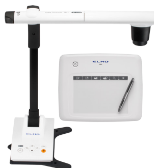
TX-1 Vision Bundle Item #: 1351-7