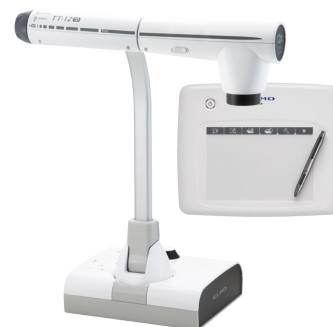
TT-12iD Vision Bundle Item #: 1349-7