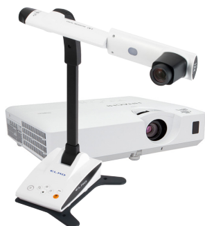
LX-1 Doc-Tor Bundle Item #: 1353-80