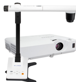
TX-1 Doc-Tor Bundle Item #: 1351-80