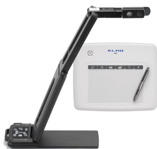
MX-1 Vision Bundle Item #: 1357-7