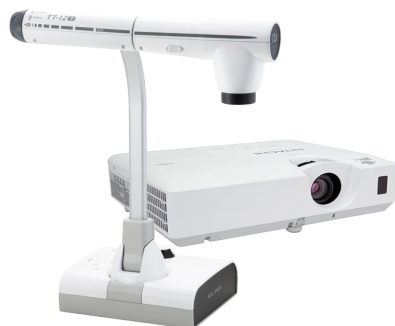
TT-12iD Doc-Tor Bundle Item #: 1349-80