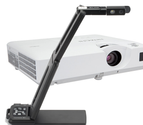
MX-1 Doc-Tor Bundle Item #: 1358-80