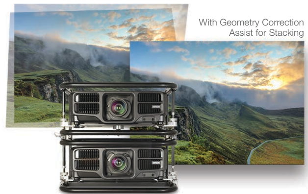
Projected images simulated