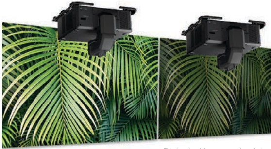
Projected images simulated

Epson cameras provide access to a variety of convenient tools to streamline installation, maintenance and operation.