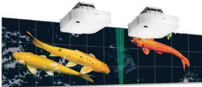
Projected images simulated

Using geometric correction — via EPPT and the camera — the stacking assist 2 function gives users the ability to combine overlapping images to produce a stunning, super-bright picture. The Simple Stacking function on select Pro Series projectors performs the stacking function without the need for a router or laptop.