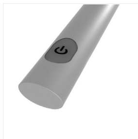
Single touch control