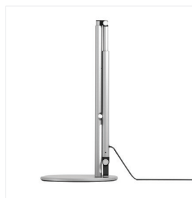
Lamp arm and head fold together