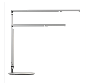
Telescoping arm and head provides flexible light control