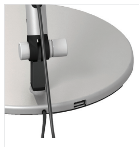
Standard base with USB charger