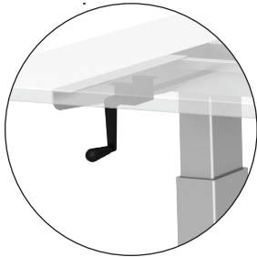
hand crank no electricity needed