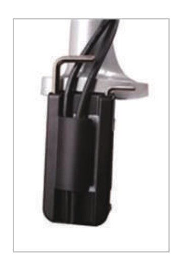
Clip-on tool storage

Available conversion kit adjusts a single arm Eppa to a dual arm