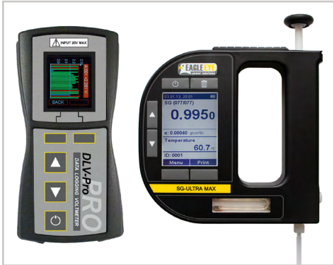
DLV-Pro Voltmeter & SG-Ultra Max Digital Hydrometer